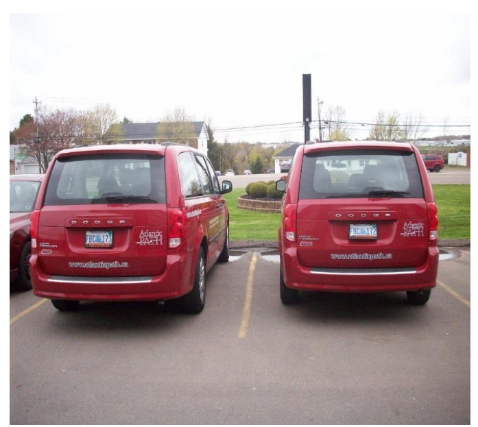
The Atlantic PATH vans drove the team through Nova Scotia, New Brunswick and Prince Edward Island, and we flew to Newfoundland and Labrador)

If you weren't able to join us during the Road Show, we videotaped the presentations in Halifax, and they can be viewed <u>online</u>.